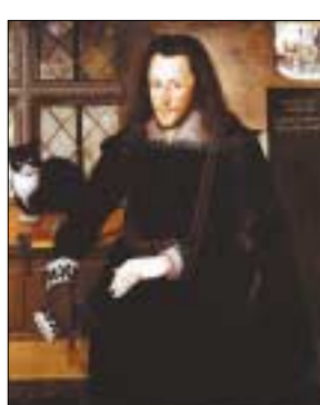
The earl painted in 1603 by de Critz

whom he describes in Number 20 as having 'a woman's face with nature's own hand painted'.